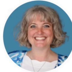
Director of Member Services & Development